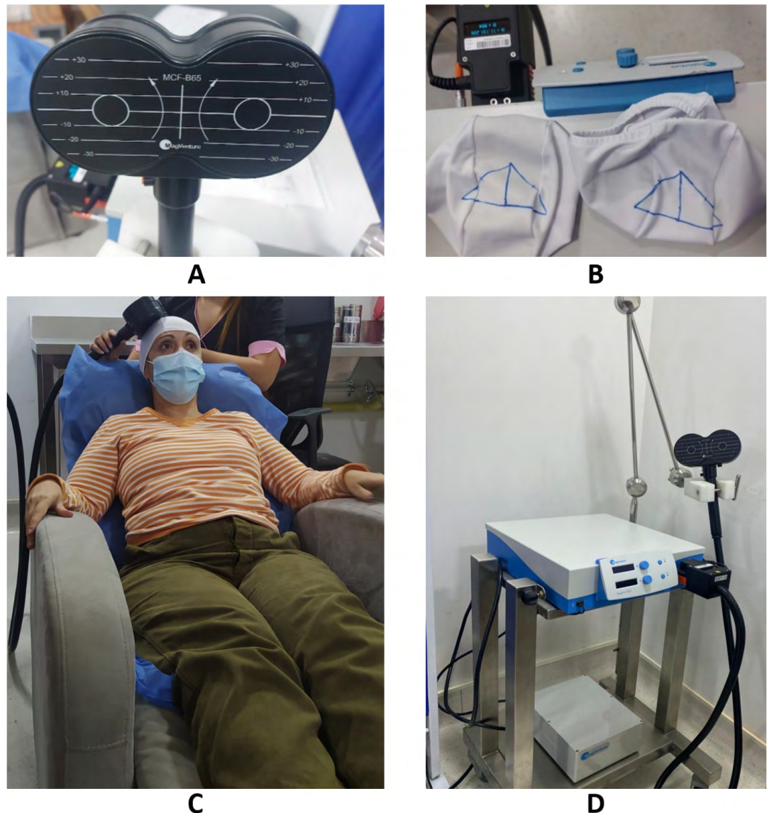
Figure 2. Figure-8 coil (A). Target marked on cap (B) rTMS therapy delivered (C) Image of the MagPro R20 magnetic stimulator (D).

tions with others, sleep, and enjoyment of life. BPI pain interference is typically scored as the mean of the seven interference items (0-10), where 0 indicates that the pain does not interfere and ten completely interferes. The BPI was selected as it is a tool designed to assess pain related to cancer [36,37] and was found to demonstrate good internal stability (Cronbach's alpha >0.70), as well as test-retest reliability [38].