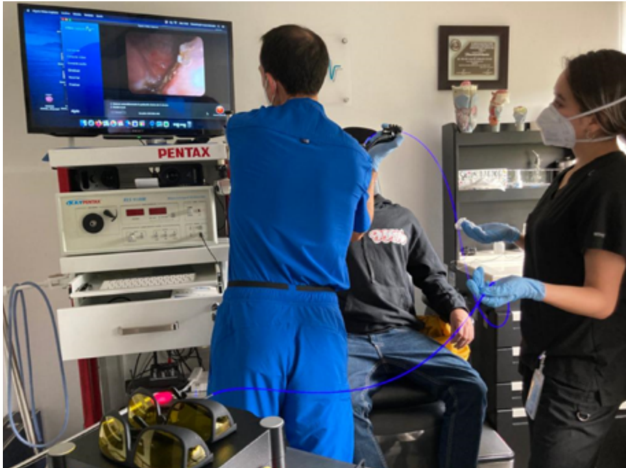
Figure 6. TruBlue photoangiolytic laser through flexible distal chip endoscope (office setting).