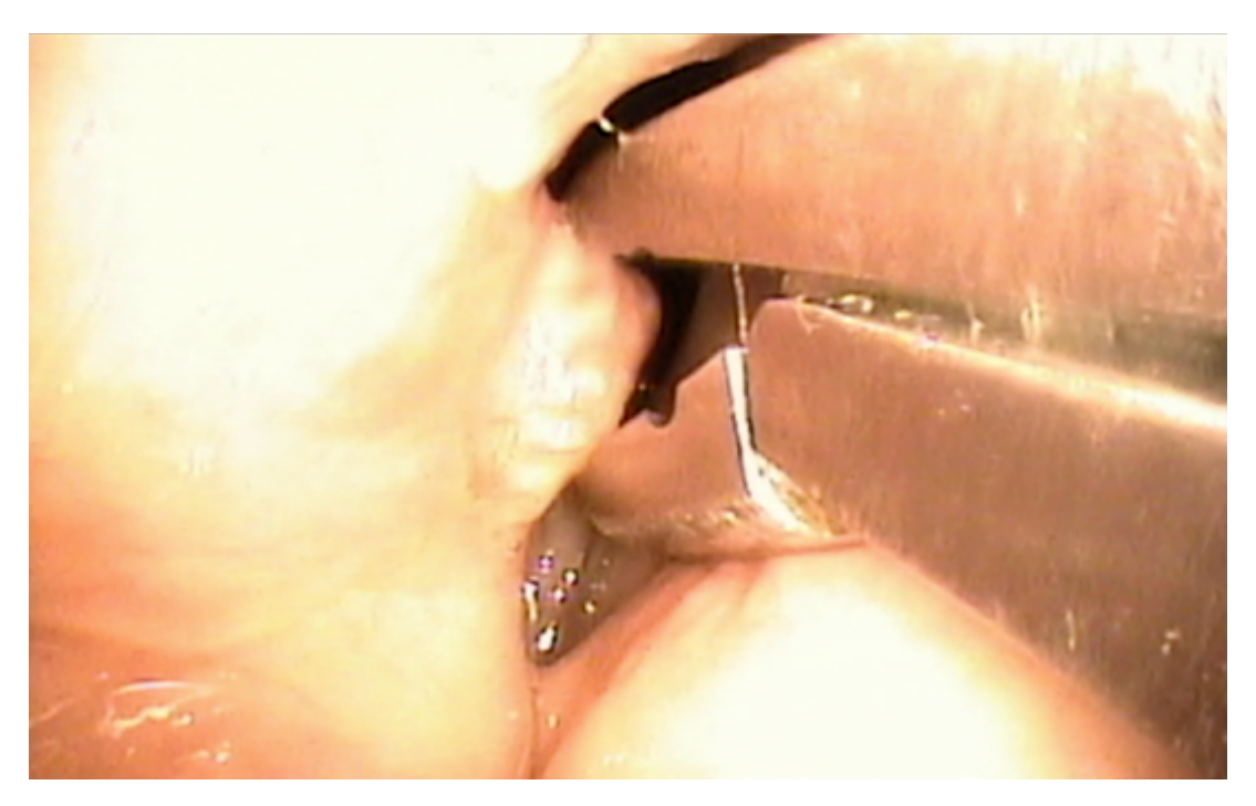
Figure 1. Biopsy of a right vocal fold tumor under local anesthesia with a transoral laryngeal forceps.