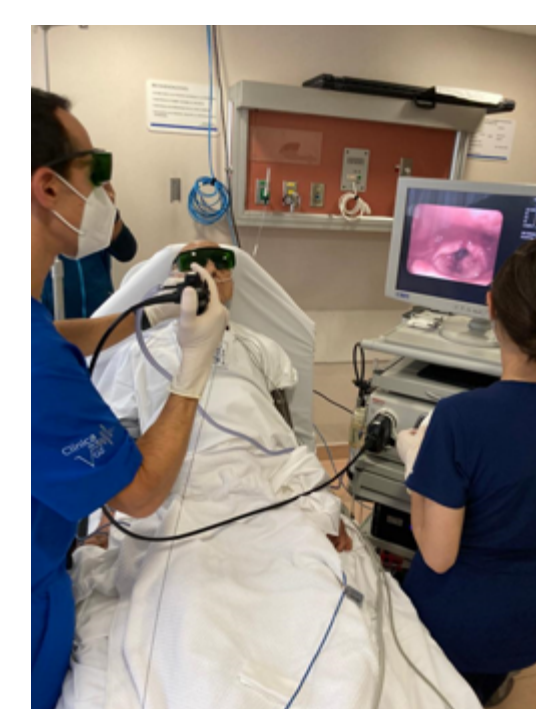
Figure 5. TruBlue photoangiolytic laser through flexible distal chip endoscope (endoscopy suite).